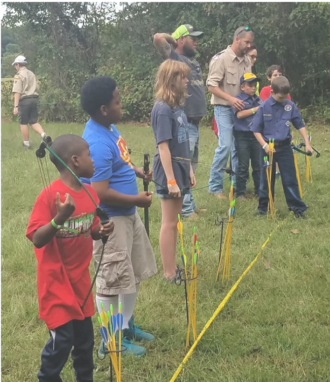
Members of Cub Scout Pack 157 try their hand at archery at the Cub Scout Shoot-o-Ree held this month in Eudora, MS.